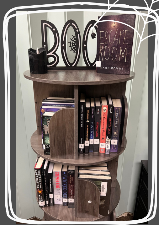
Our Spooooooky corne is coming along.