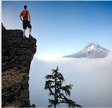
Climb the Mountain and See Beyond