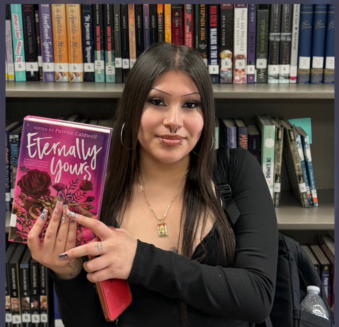
Eternally Yours by Patrice Caldwell